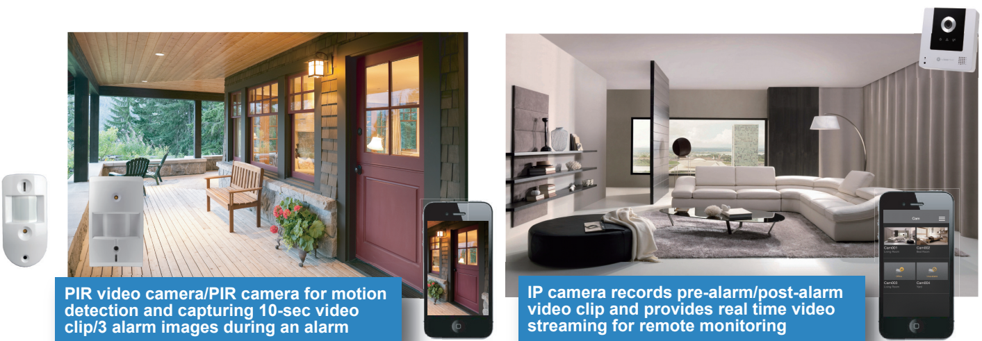
PIR video camera/PIR camera for motion detection and capturing 10-sec video clip/3 alarm images during an alarm

The ML system is one of the F1 Security@2km Series' control panels delivering record-breaking 2-km communication range and superb reliability. Its extensive RF coverage allows the installer to set up the alarm system on large or complicated premises with great flexibility. The ML Series is compatible with the F1 Series of accessories that feature long RF range.