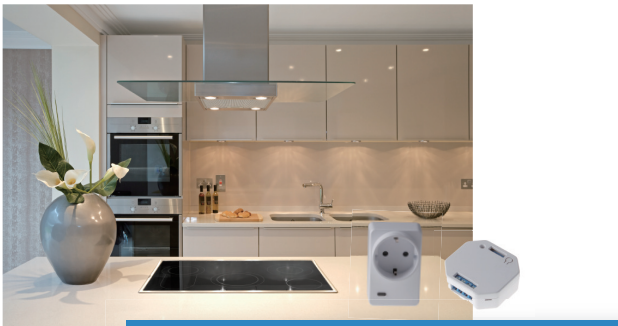
Adopting ZigBee HA 1.2 profile, ML series is compatible with all ZigBee accessories produced by other manufacturers

Home Automation allows homeowners to gain a centralized control over household appliances, lighting system, and digital door locks for enhanced security, comfort, and energy efficiency. ML series panels adopt ZigBee Home Automation 1.2 profile and are compatible with all ZigBee sensors and accessories such as Power Metering Switch, Power Switch, and Dimmer Switch...etc. from other manufacturers under this profile to perform home automation and energy monitoring functions.